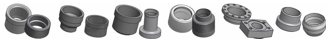
Threaded Connection Victaulic Connection Solder Connection Combo Connection Flange Connection Weld Connection

*For specific dimensions, or information about other types of connections, please contact your SWEP sales representative.